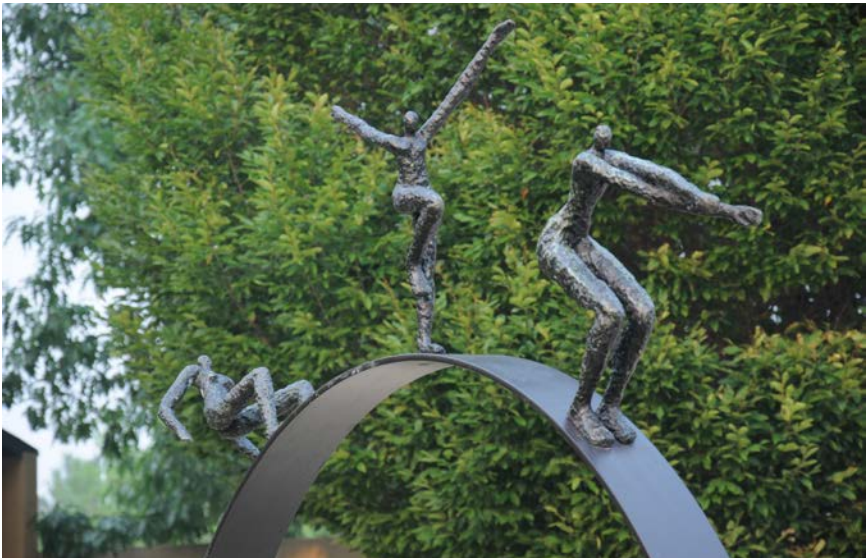
Sculpture, Mission Hill Family Estate - Okanagan

As part of its celebration of National Volunteer Week, RTOERO launched on April 28, 2022, an exciting new service for district executives – a new RTOERO Learning portal, a one-stop destination for virtual learning related to one's district executive role – and more! It will be an excellent resource for new and existing district executive members. This functionality will be extended to all RTOERO members in 2022.