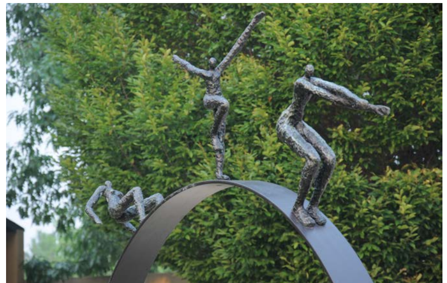
Sculpture, Mission Hill Family Estate - Okanagan

As part of its celebration of National Volunteer Week, RTOERO launched on April 28, 2022, an exciting new service for district executives – a new RTOERO Learning portal, a one-stop destination for virtual learning related to one's district executive role – and more! It will be an excellent resource for new and existing district executive members. This functionality will be extended to all RTOERO members in 2022.