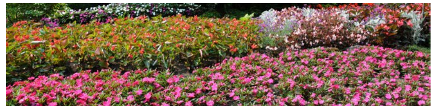
Butchart Gardens, Victoria BC

I would like to thank the many Executive members who have assisted me in our substantial work over this past year.