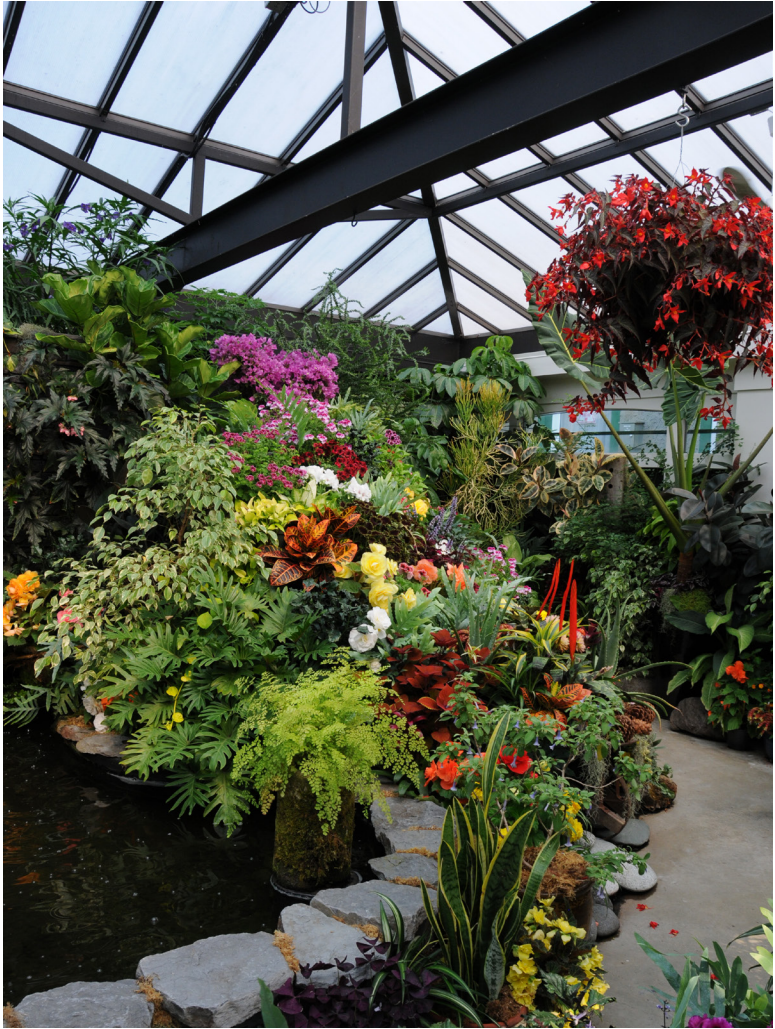
Greenhouse, The Burchart Gardens, Victoria, BC