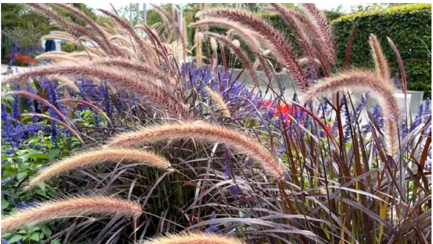
Ornamental grasses