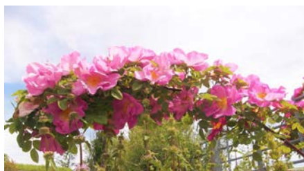
Wild Roses, TBG

See “Second Vice President's Report” on page 15.