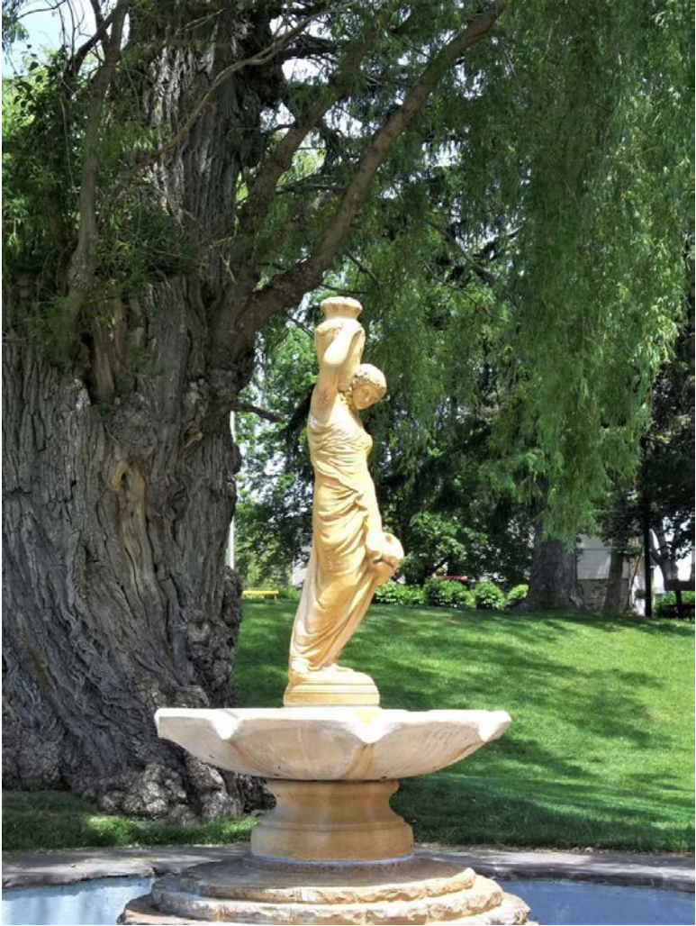
Toronto Botanical Gardens Fountain