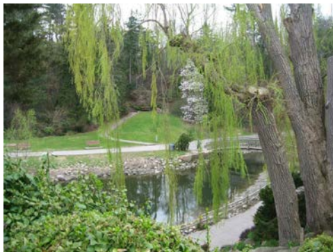
Edwards Gardens-Willows and Wilket Creek

The RTOERO Retirement Planning Committee members recognize that ongoing recruitment is crucial and the key ingredient for the healthy growth of our organization. Indeed, as mentioned in this year's editions of Stony Bridges , all members of the RTOERO community are encouraged to promote and share the many advantages of being a member of RTOERO with their family, friends and acquaintances working in the broader education community. All are welcome!