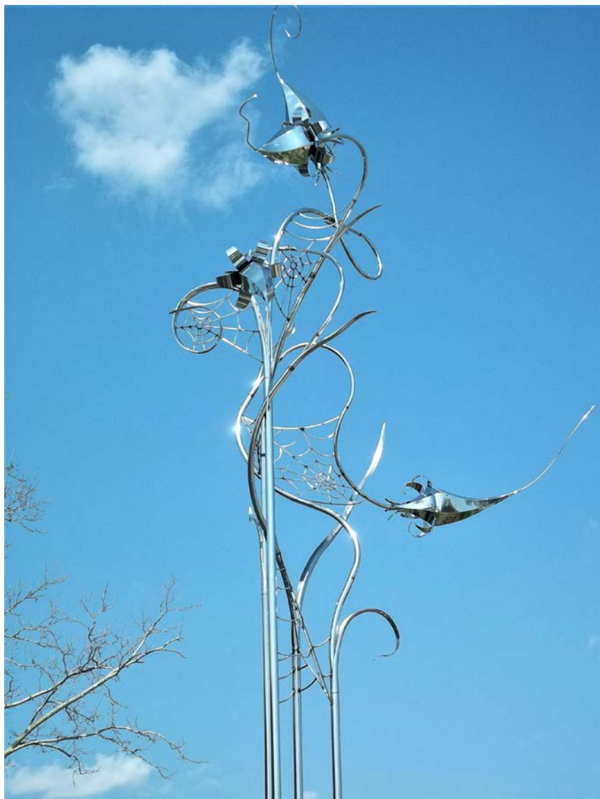
Garden Web sculpture, TBG