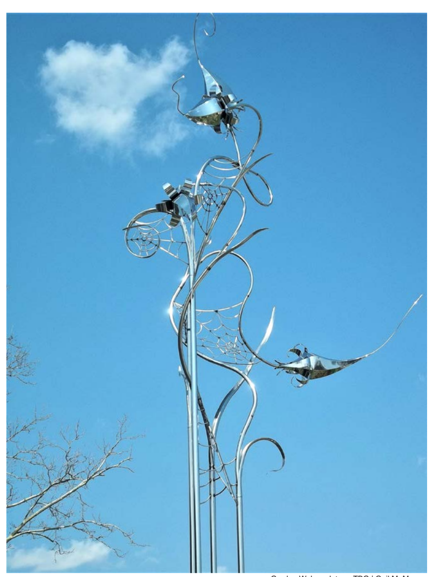
Garden Web sculpture, TBG