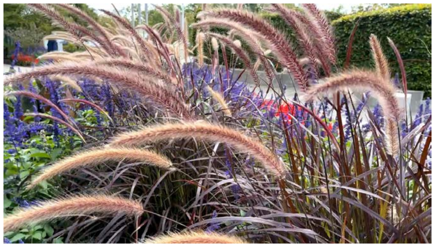
Ornamental grasses