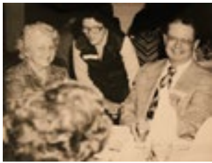
Luncheon at the Granite Club 1977