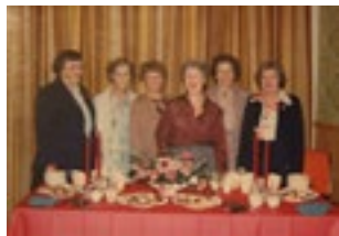
Retirees reception, 1980