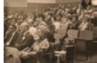
Pre-retirement Seminar 1978