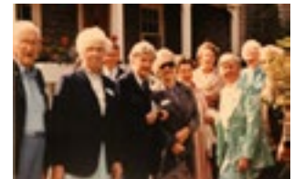
Visiting Picton, 1986