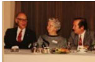
Fall Banquet, Nov. 1986